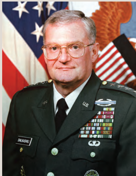
General John M.D. Shalikashvili, USA